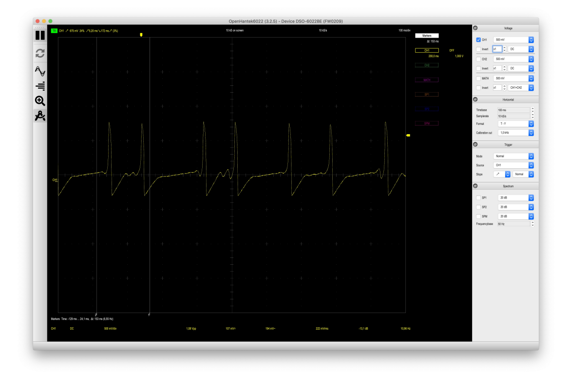
Figure 2: Behavior of the three time scale system